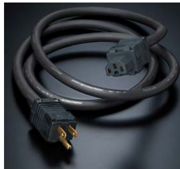
G-314Ag-18 Power Cord Included

e-TP80: Type: 2-Pole + Earth • Rating: 20A 125V AC G-314Ag-18: Type 2-Pole + Earth • Rating: 15A 125V AC