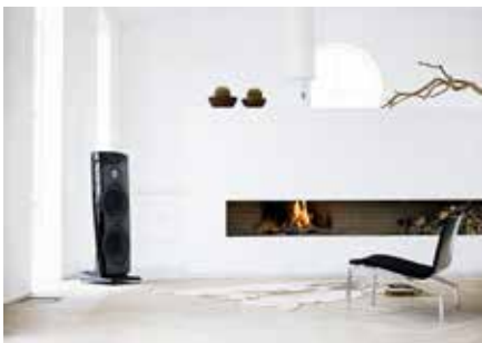
THE LEGENDARY JAMO R 909